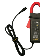
AC/DC CURRENT PROBE MODEL MR417 (BNC CONNECTOR)