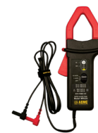
AC/DC CURRENT PROBE MODEL MR526 (BANANA CONNECTOR)