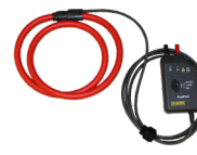
AMPFLEX® FLEXIBLE SENSORS