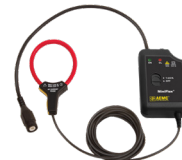
MINIFLEX® FLEXIBLE SENSORS