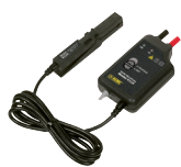
DC/AC MICROPROBE MODEL K110