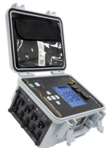
POWER & ENERGY LOGGER MODEL PEL 115