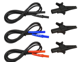
REPLACEMENT LEADS WITH CLIPS FOR MODELS 6608 & 6609