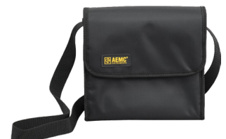
CARRYING POUCH FOR CABLE TESTERS, MEGOHMMETERS, MULTIMETERS, ETC.