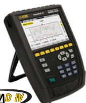
POWERPAD® MODEL 8345