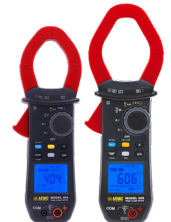
MODELS 404 & 606