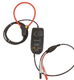
MINIFLEX® 14" MODEL MA114

We offer custom probes to meet your application. Just let us know your specific needs! To get started, go to our website www.aemc.com , click on the Support tab and fill out the Customer Service form.