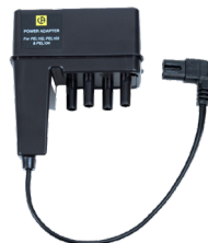
ADAPTER - 600 V CAT III POWER TO PHASE ADAPTER FOR USE WITH MODELS PEL 112 & PEL 113

Our range of accessories cover a spectrum of applications, from multimeters and oscilloscope probes to power analyzers and thermal imaging cameras. Plus, our accessories are engineered with the highest industry standards, ensuring that you can conduct tests confidently, knowing that you and your equipment are protected. No matter the complexity of your electrical setup, we've got the right tool and accessory to streamline your testing processes. All accessories are available on our website!