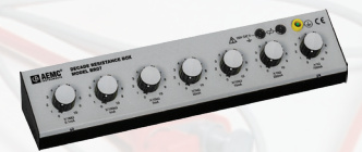
RESISTANCE DECADE BOX MODEL BR07