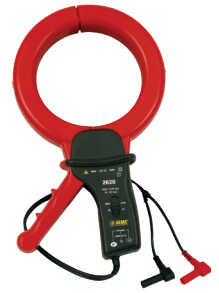
LEAKAGE CURRENT PROBE MODEL 2620