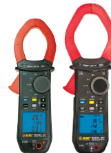
MODELS 407 & 607