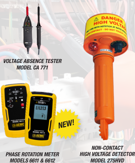
VOLTAGE ABSENCE TESTER MODEL GA 771