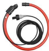
AMPFLEX® SENSOR MODEL 196A-24-BK FOR MODELS 8435, 8436 & PEL 115