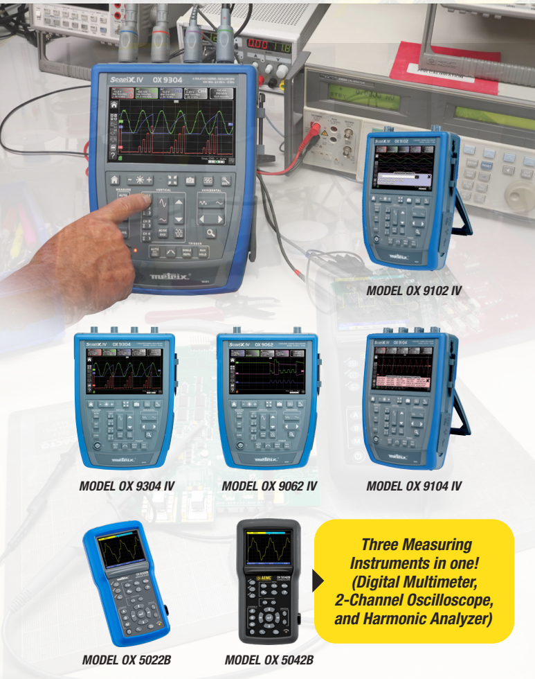
MODEL OX 9102 IV