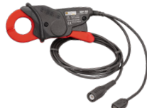
AC/DC CURRENT PROBE MODEL MH60