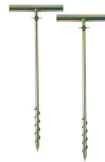
17" STAINLESS STEEL T-SHAPED AUXILIARY GROUND ELECTRODES