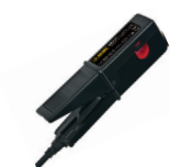
AC CURRENT PROBE MODEL MN01