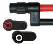
ADAPTER - BANANA (FEMALE) - BNC (MALE) (XM-BB) FOR USE WITH AMPFLEX SENSORS, MODELS K100/K110 AND SLII DATA LOGGERS