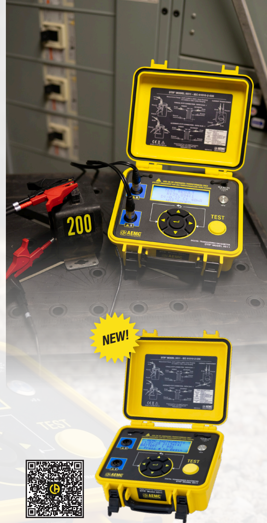
DTR® MODEL 8511